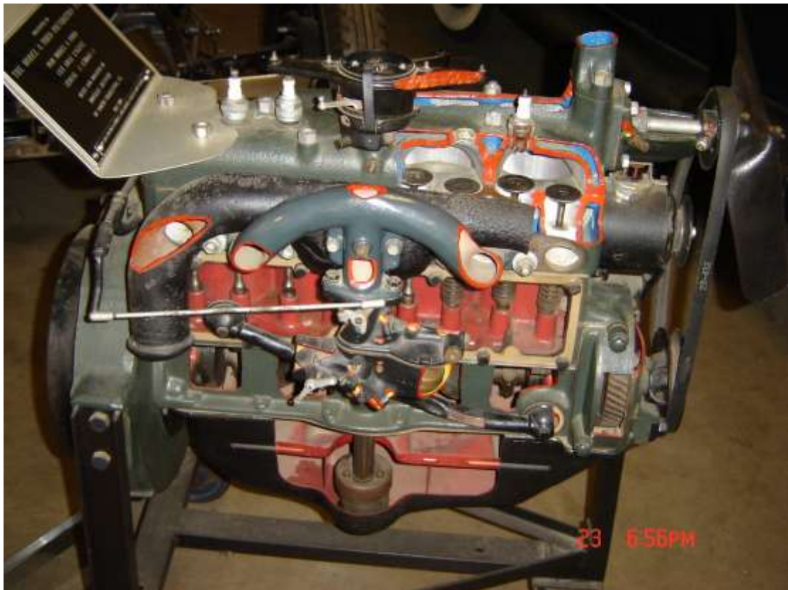
This Months cover shot is an insider's view of a cut down Model A Ford Engine.....

The New Zealand Rebel A Ford Club C/- 492 Main Road Hope, R.D.1., Richmond, Nelson 7081, New Zealand.