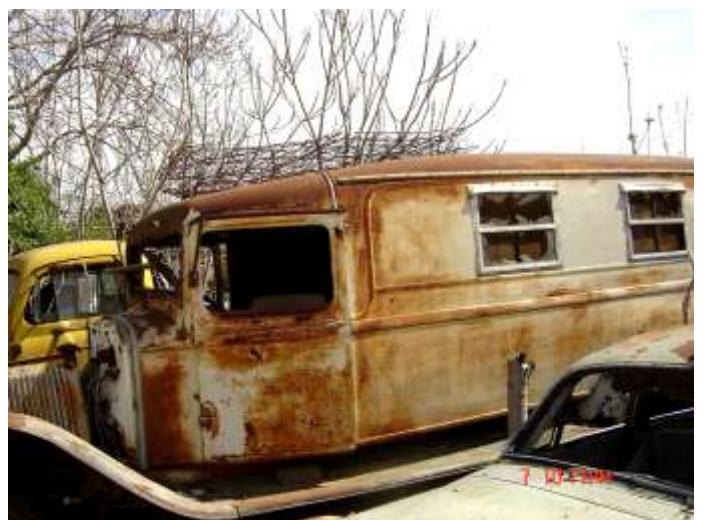
and an early presumably 32 Ford Paddy Wagon van...