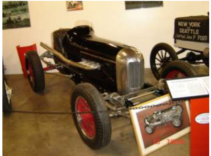
Flat head four engined speedster