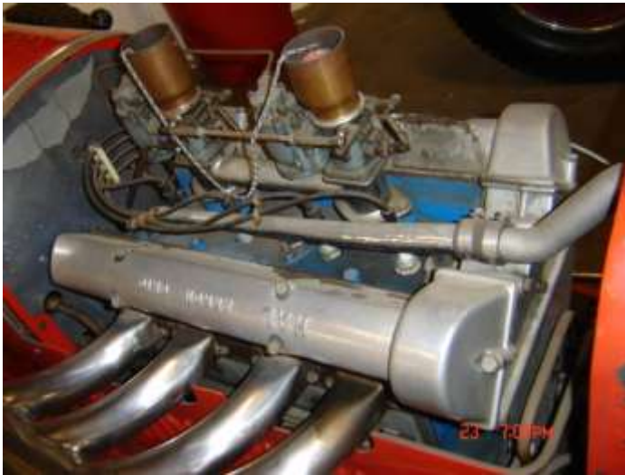
USA "HAL" Model A Ford Twin Cam speedster engine