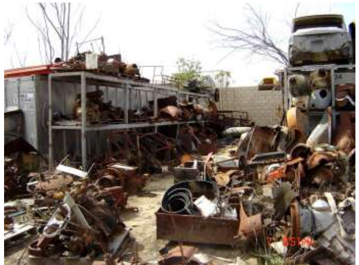
Just some of the pile of parts Derek & Ross cane across (too dear)