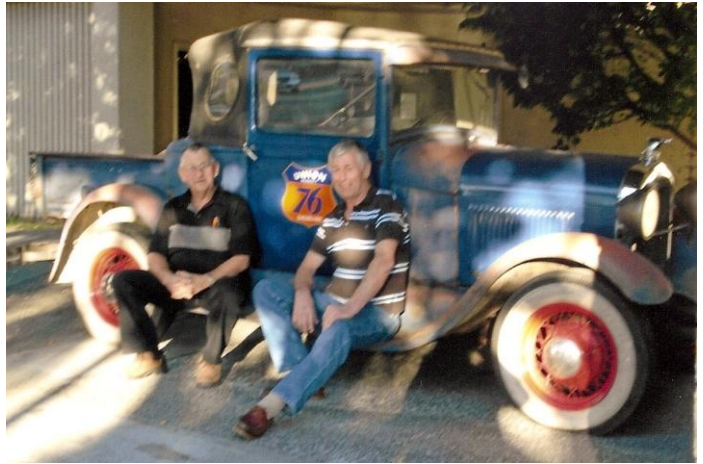
The two D's relaxin' Canadian Style on a Sport Coupe Pickup?.