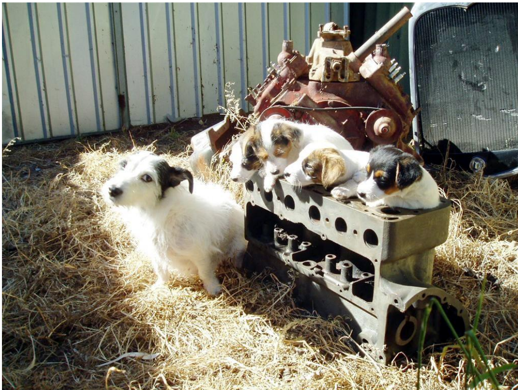
This Months cover shot is a bit of a Four Banger but just a puppy of an engine.....

The New Zealand Rebel A Ford Club C/- 492 Main Road Hope, R.D.1., Richmond, Nelson 7081, New Zealand.