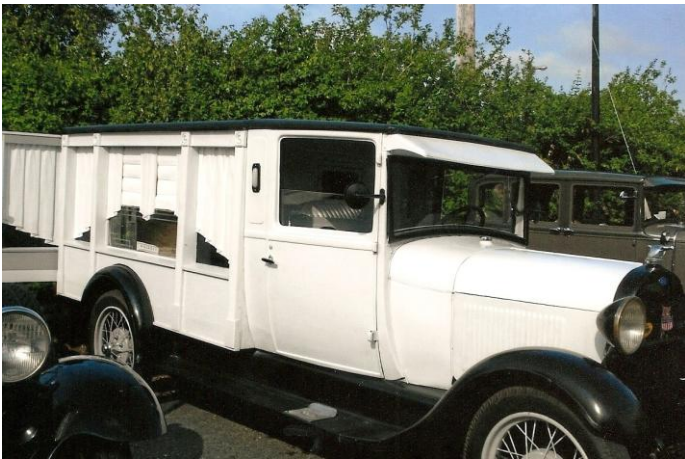
Stretched Model A Hearse - all white - complete with Coffin !!!