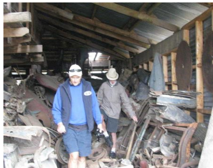
like Pigs in muck – Horipito Model A Parts !