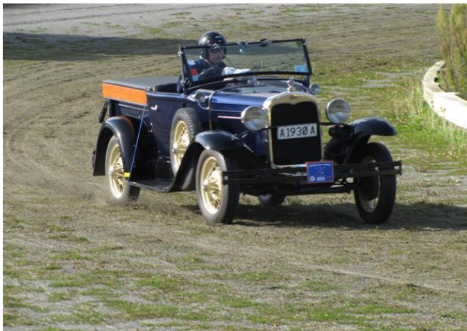
Speed event Greymouth – Jason Jurasovich 1930 Roadster Pickup