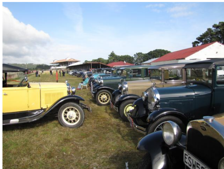
Model A's – jus some of the many great vehicles