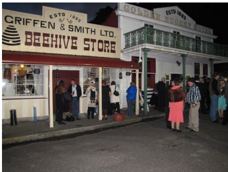
Era fashion at the Shanty Town evening function