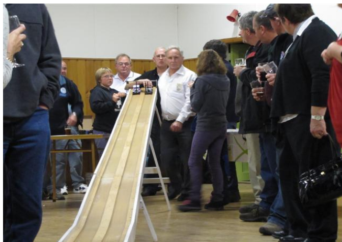
Hubley Racing track at the prize giving night in Hope.