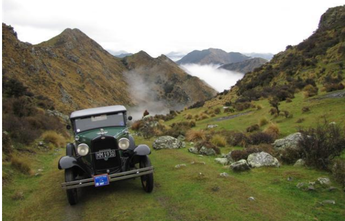
The only Model A that made it to the top of Blarich “off road day” great view.