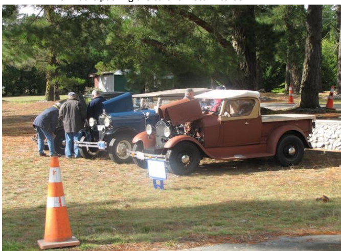
Judging the modified class at McLeans Island Christchurch