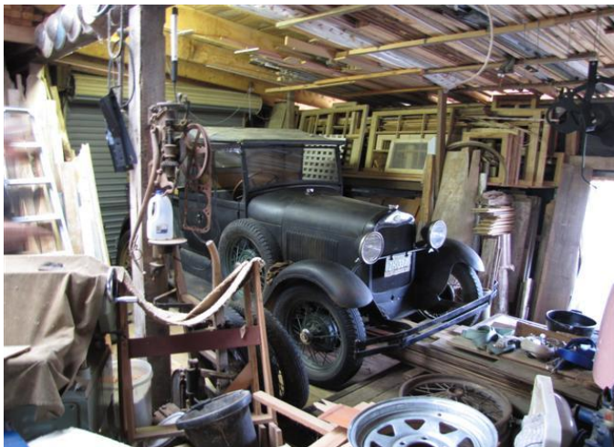
Found on the way to the Rally – one of many new finds