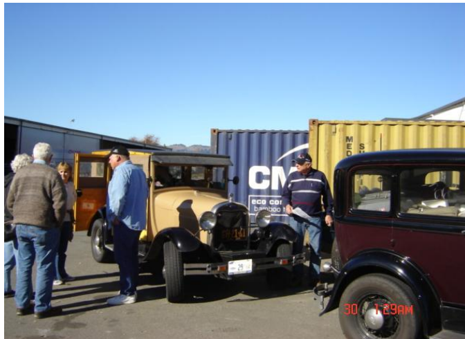
FAST Fours packing the cars for return to USA