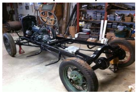
Chassis with overdrive and all parts