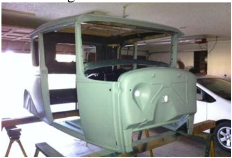
Body after sandblasting