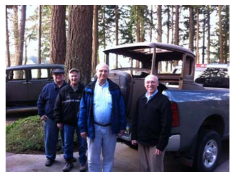
The usual suspects – body movers