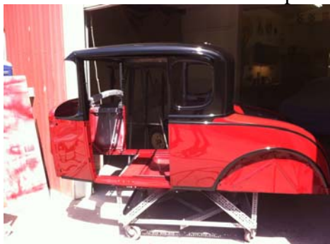
The final paint completed