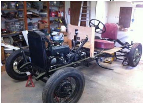
Chassis ready to drive