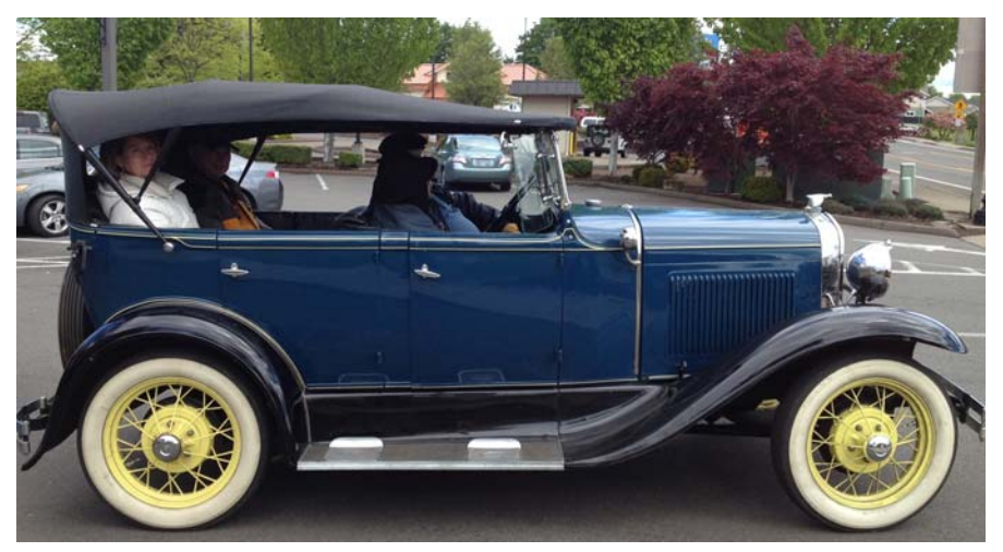
Our Fearless Leaders