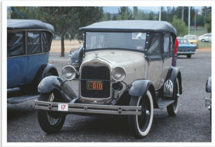
Photo of car taken in 1978 is attached.