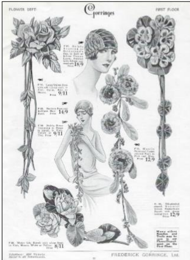
- Gorringe's Catalog Autumn 1928