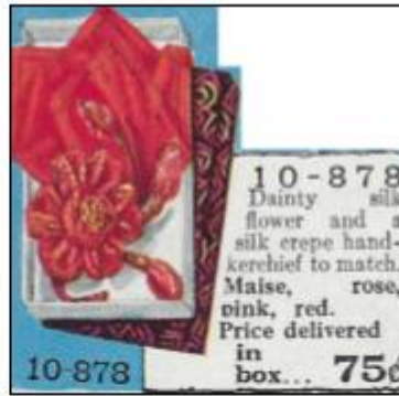
- The Robert Simpson Company. Catalog Fall and Winter 1928-29.