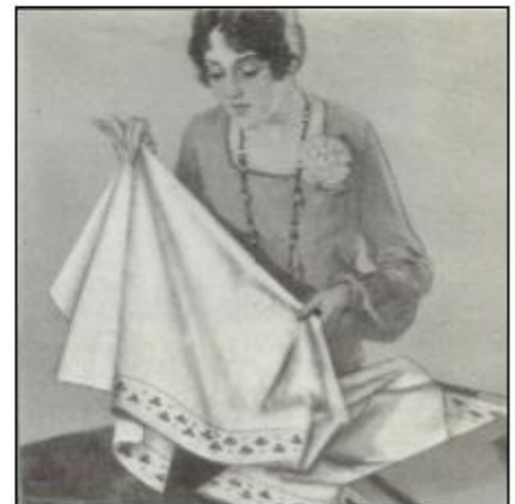
- August 1928 Good Housekeeping ad for linens.