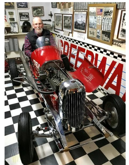
Jim Corbett, racing driver