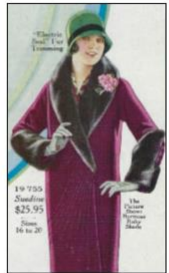
-The Robert Simpson Catalog Fall & Winter 1928-29