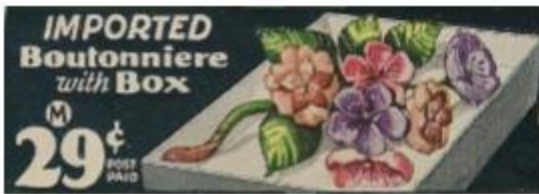
- The Chicago Mail Order Company Winter 1929-30

Read the full article on the MAFCA Website at http://www.mafca.com/ef_articles.html and learn how artificial flowers were used in daily fashion during the Model A years!