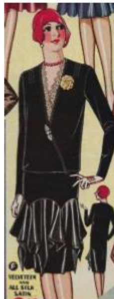
-Chicago Mail Order Co. Winter 1929-30