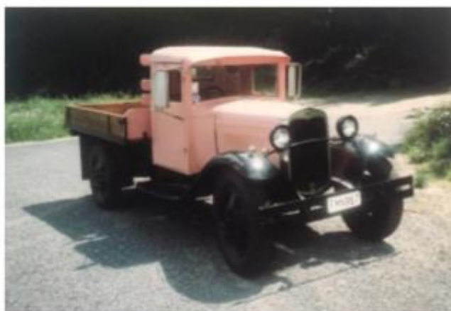
Bruce with his last Model A Truck. Found in a shed in Tokoroa, it was purchased for $300.00 and took 5 years to restore.