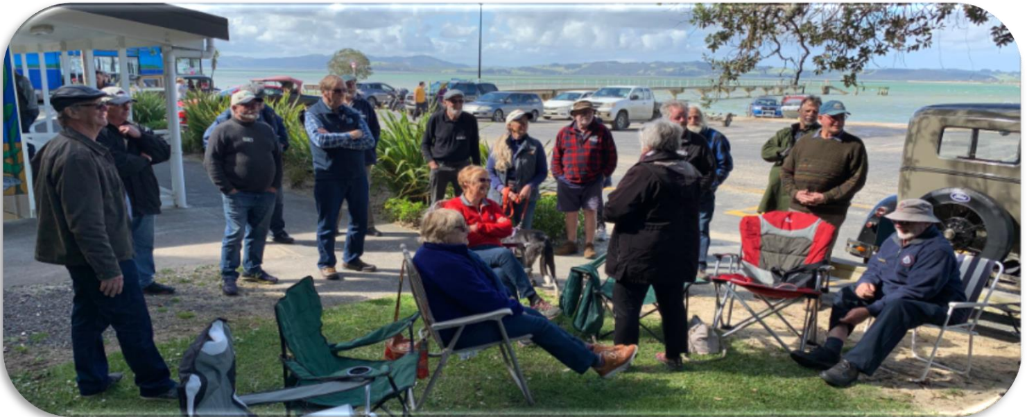
Shelly Beach car run on the 20 th September 2020, (Beautiful Day)