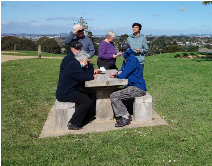
A lovely day for club members at Sanders Reserve working through the navigation exercise.