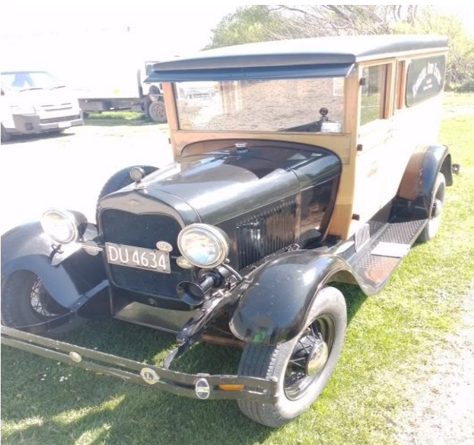
You can't keep the lads away from a good Woodie!