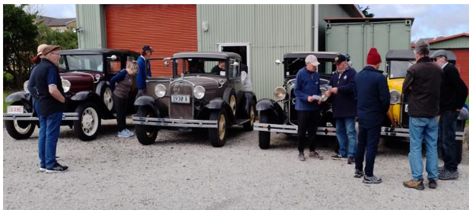
Model A's and members at the North Shore Vintage Car Club.